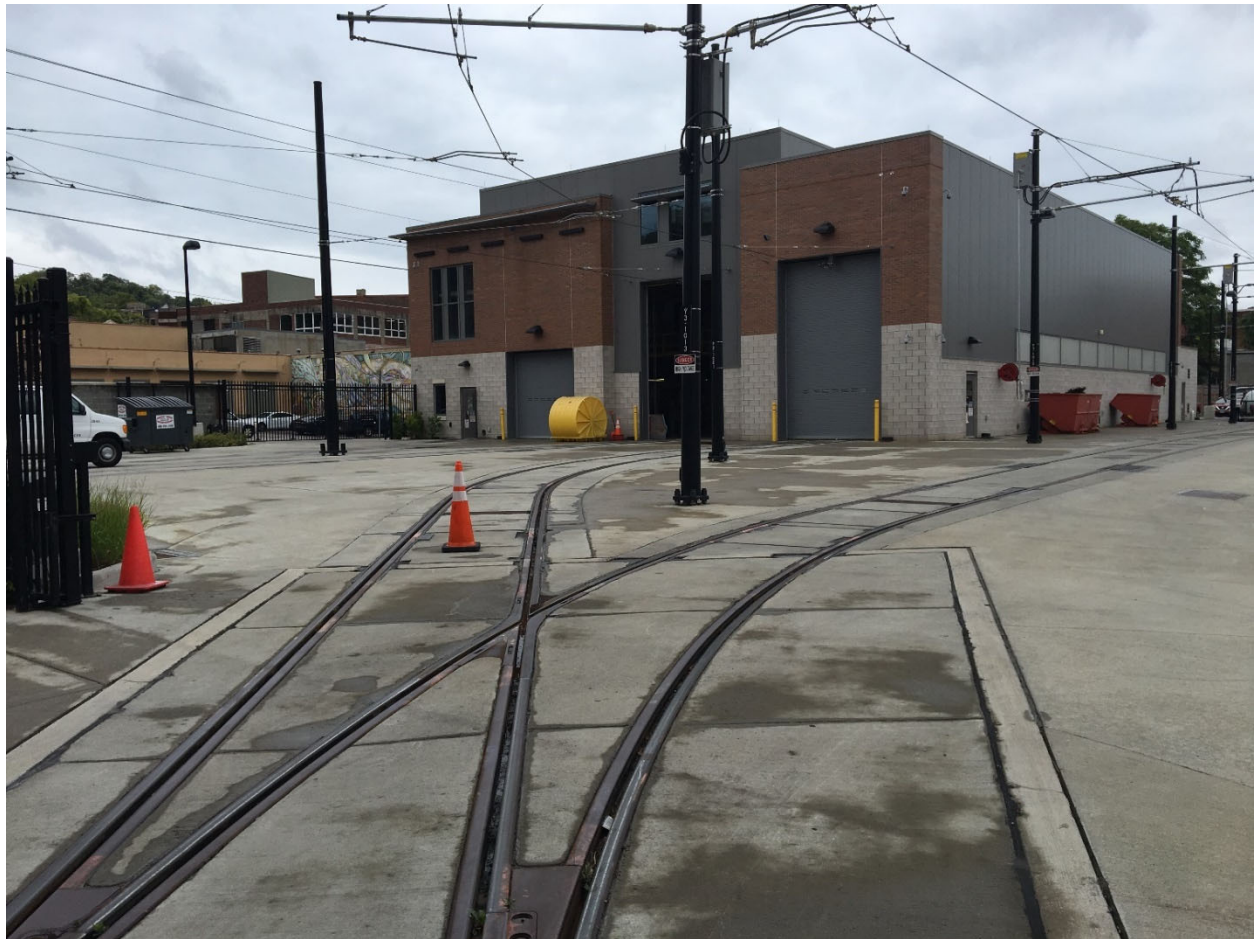
Figure G-1. Cincinnati Streetcar Maintenance and Operating Facility (MOF)

On weekdays, the streetcar runs every 12 minutes between 11:00 a.m. and 7:00 p.m. The streetcar operates every 15 minutes all other times.