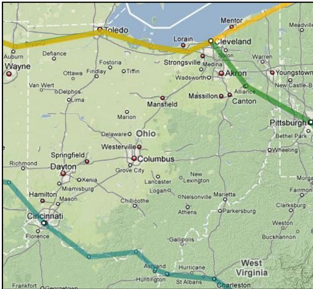
Exhibit 9-4 Current Amtrak Service Routes in Ohio

The Capitol Limited and Lake Shore Limited intercity rail services are supplemented by daily Amtrak Thruway Motorcoach service in Toledo. A Thruway bus departs Toledo for East Lansing (Detroit) at 6:30 AM and arrives at Toledo from East Lansing at 11 PM, with sufficient time for riders to make connections to and from the trains. The following map shows the three routes as they pass through Ohio.