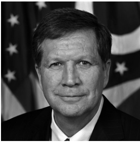
John R. Kasich Ohio Governor