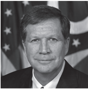
John R. Kasich Ohio Governor