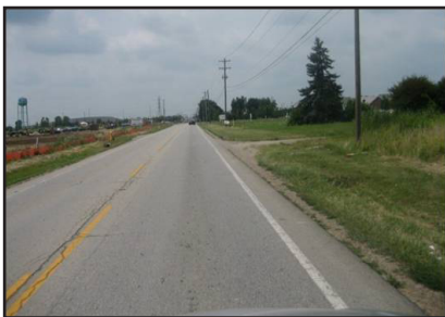
Before Phase 1

For 10 years, the City of Grove City, ODOT, and many stakeholders have worked together to improve safety and congestion on I-71 and SR 665.