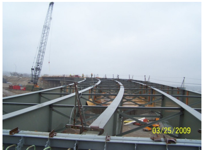
The new flyover bridge from SR 4 southbound to I-75 southbound