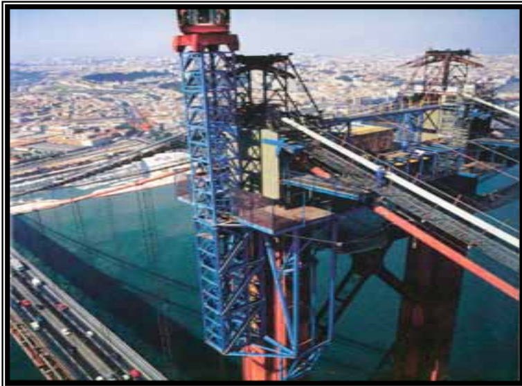
Tagus River Bridge