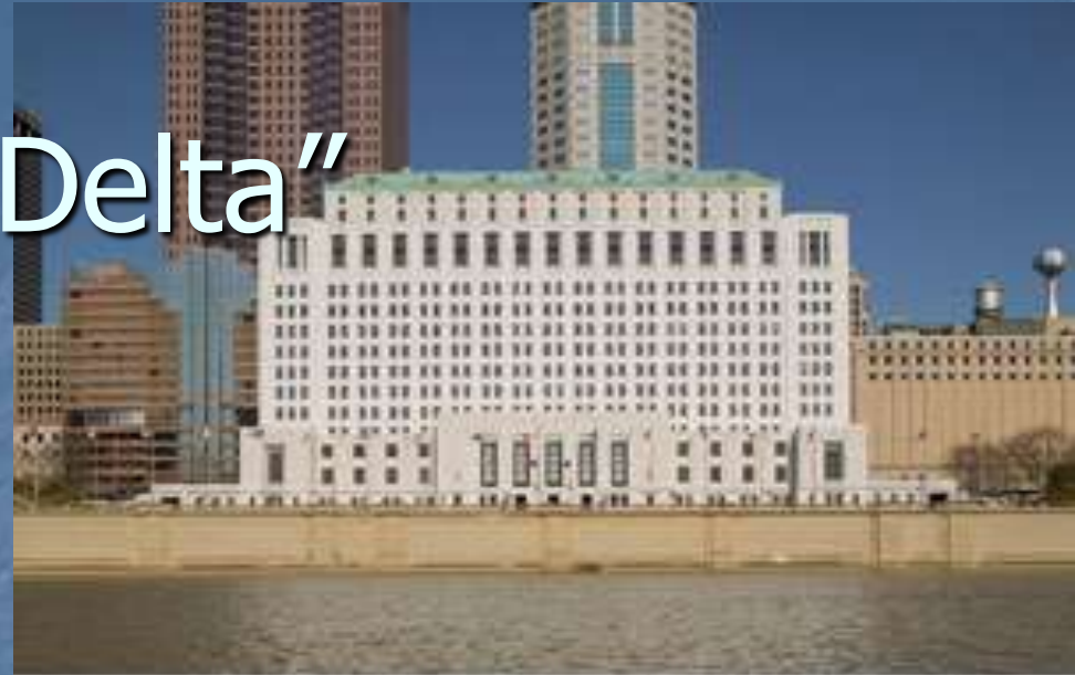
The Ohio Judicial Center