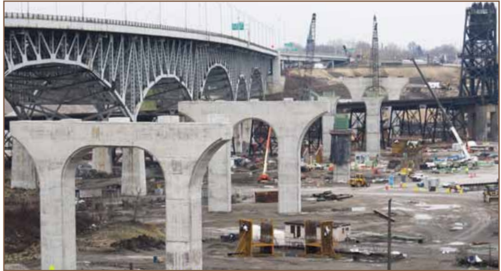
Piers 9 through 5, nearing completion. These piers are located between W Third Street and the river, viewed from the Lorain-Carnegie Bridge.

While winter weather makes it more difficult, crews can continue to drive H-piles – the long, steel beams driven into the ground which support the new bridge – and concrete can still be placed for the bridge piers' foundation footers, columns and caps. Over the next three or four months, most of the remaining east bank bridge piers will be completed. The schedule for