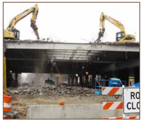
Crews removed the pavement from half of the I-90 west bridge over Kenilworth on January 24.