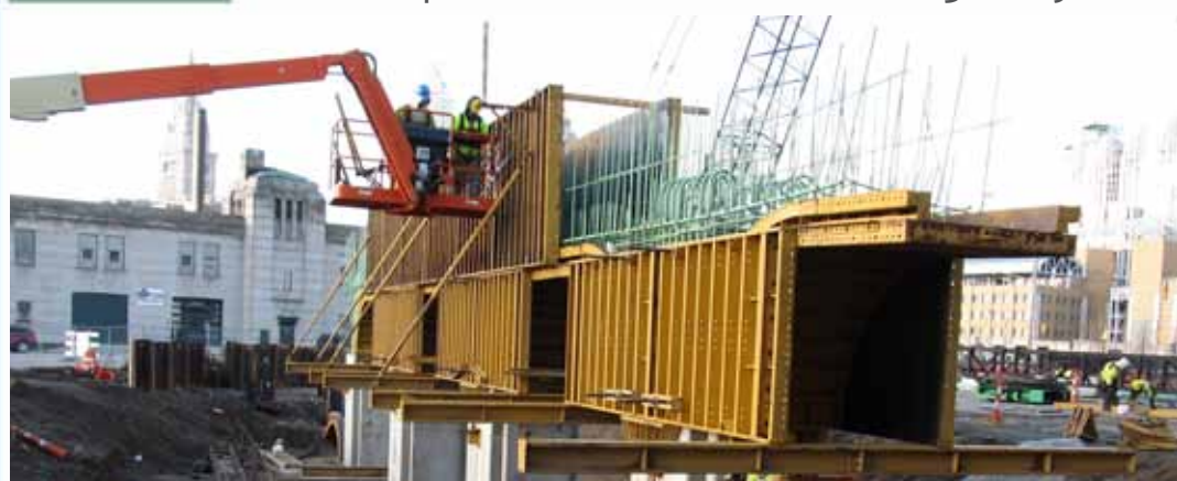
Top: Carpenters, ironworkers and laborers all play a role in preparing this bridge (I-90 west over E 9th St) for pouring the concrete deck. Bottom: Carpenters work to assemble the pier cap forms on Pier 13.