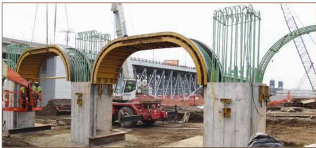
Carpenters began installing cap forms on Pier 12 on January 11.