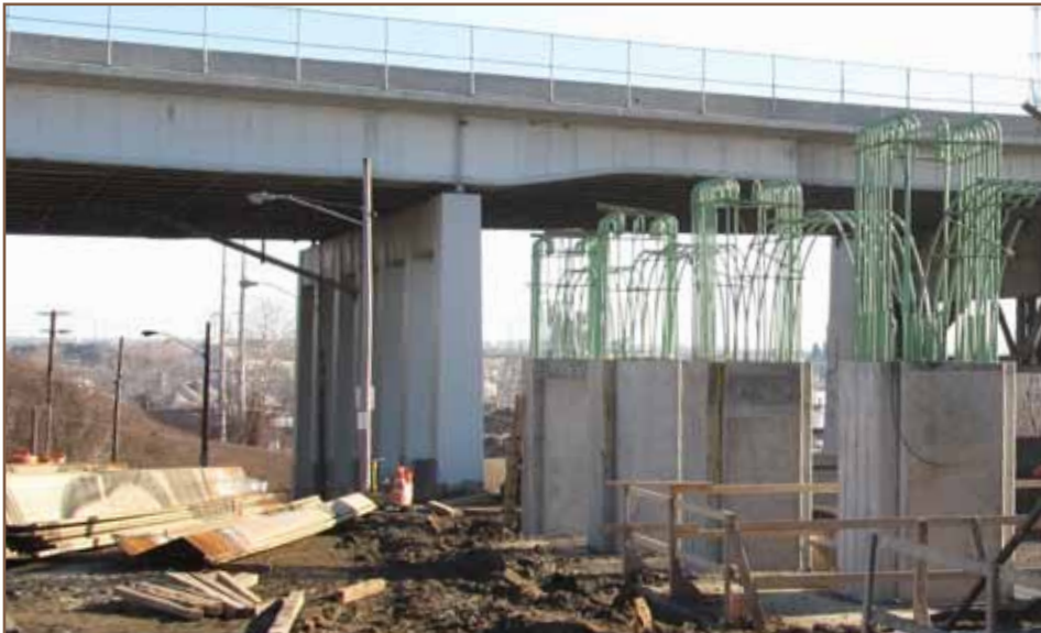
Pier 12 on January 6. Crews have backfilled around the foundations and the column sections are complete.

the W 14th Street exit ramp, shifting it closer to the existing bridge and installing shoring along the edge of the ramp to protect it during the continuing bridge pier construction. Once the W 14th ramp is prepared and reopened, the Abbey Loop ramp will be closed so that construction of the new Abbey Loop ramp and the bridge piers can continue in that general area. Access to Abbey Avenue will be maintained throughout the construction in the area and access to Tremont will be very easy via W 14th Street.