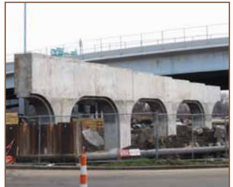
Pier 13 is complete on January 11.