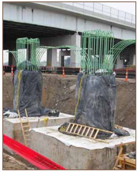
Part of Pier 13 on October 26. The foundation is cured and the columns have just been poured.

Winter's cold weather does not interfere with most of these tasks, although snow, ice or high winds can create problems for some activities. At the peak of the construction season during the summer and fall, the project averaged more than 260 trade workers employed. The winter employment average varies between 75 and 100 trade workers. While there are fewer workers on the job, they continue to accomplish the critical steps that will keep this project on schedule!