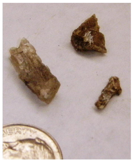
FIGURE 1120-1 Gypsum crystals