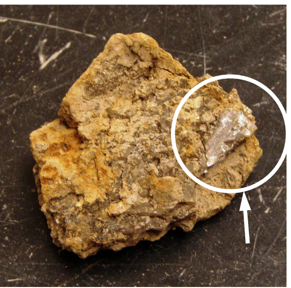
FIGURE 1120-2 Gypsum crystal in clay