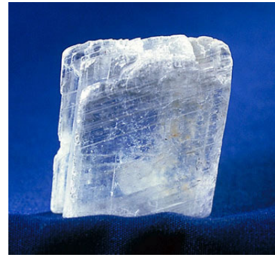
FIGURE 1120-3 Specimen quality gypsum crystal