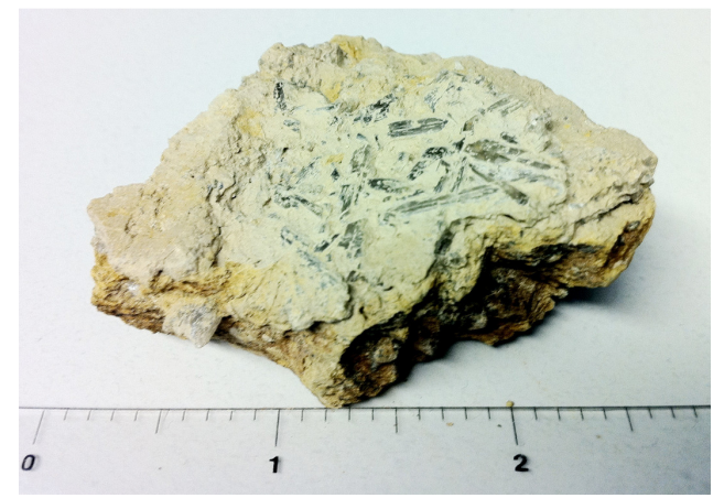
FIGURE 1120-5 Gypsum crystals in clay

For more information about identifying minerals, see FHWA (1991) Rock and Mineral Identification for Engineers , Publication No. FHWA-HI-91-025, U.S. Department of Transportation.