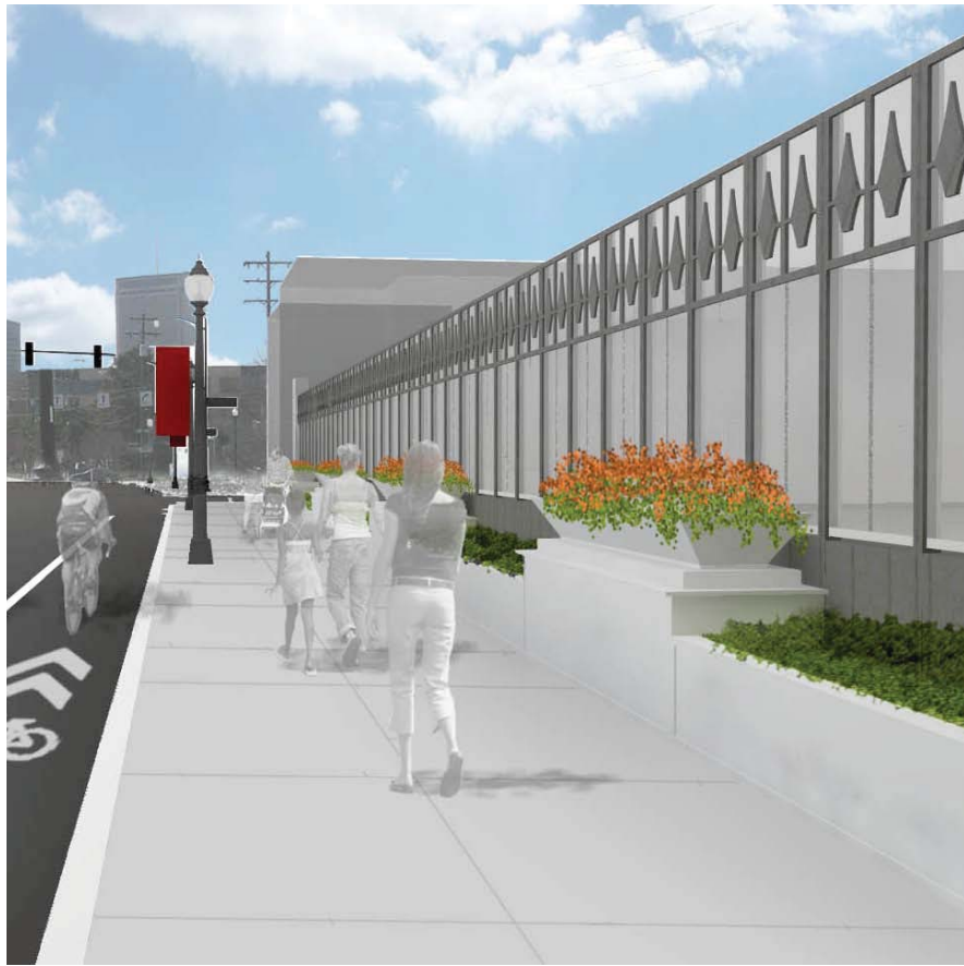
PROPOSED VIEW TOWARD DOWNTOWN - DAY