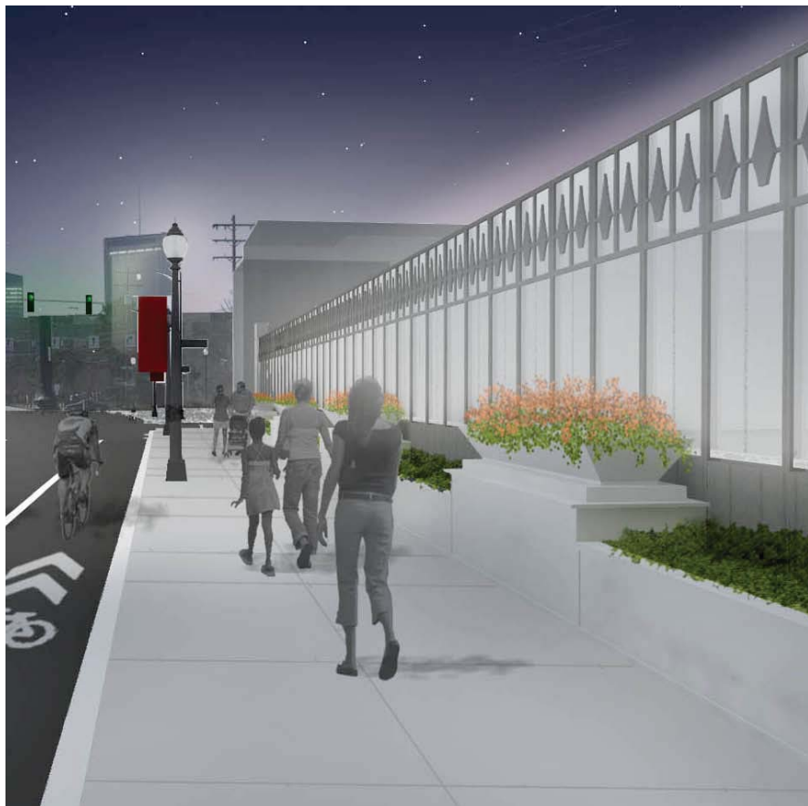
PROPOSED VIEW TOWARD DOWNTOWN - NIGHT