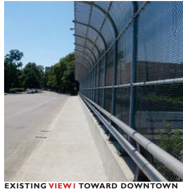
EXISTING VIEW TOWARD DOWNTOWN