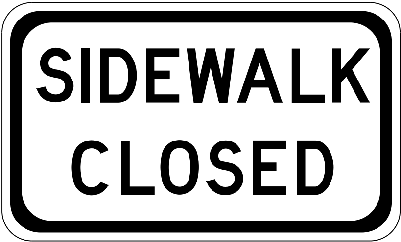
ALL DIMENSIONS SHOWN IN INCHES